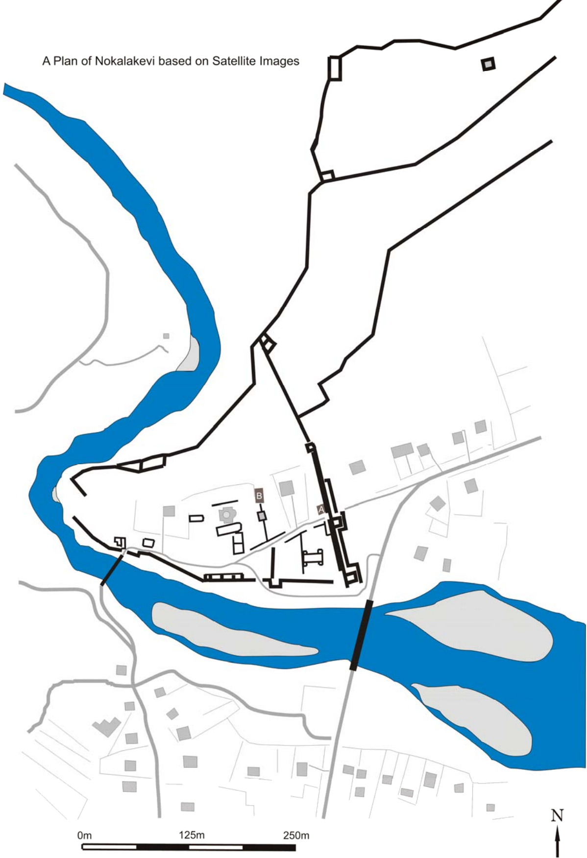
Figure 1: Plan of Nokalakevi showing location of Trench A by the East Gate (drawn by P Everill)